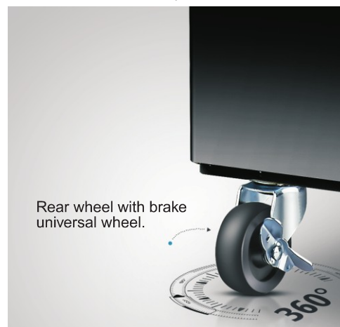
Rear wheel with brake universal wheel.

All models are wheel-moving design, easy to install in corners and other small spaces.